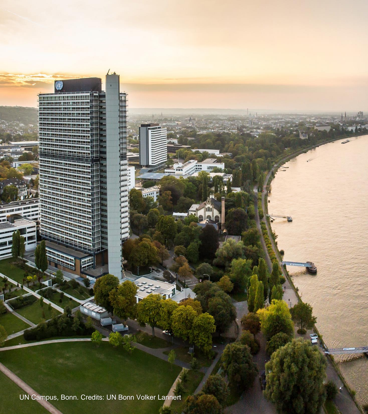
UN Campus, Bonn.